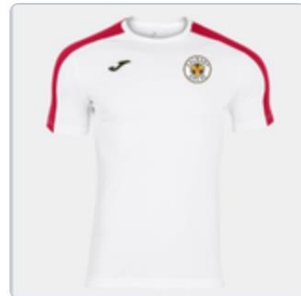
Away Jersey (white)