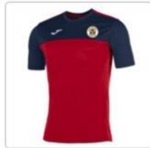
Home Jersey (red)