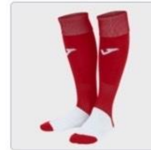
Professional II Socks